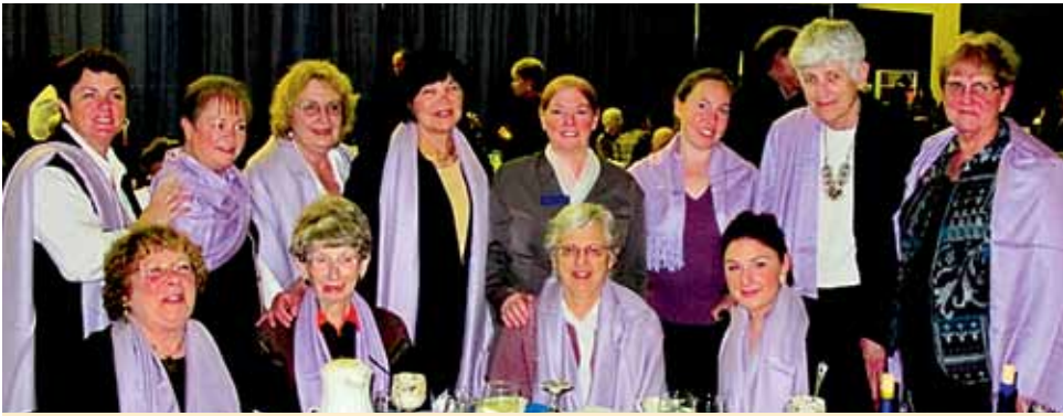
Members of Abby's House and the Worcester Women's History Project travelled to Seneca Falls, NY to witness Abby Kelley Foster's induction into the National Women's Hall of Fame.